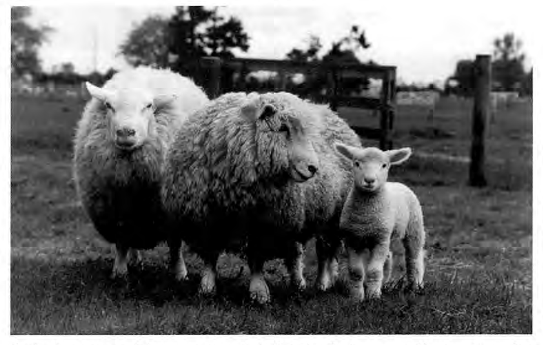
Fig. 2. Clone-associated phenotypes are not heritable in the offspring generated from sexual reproduction. The lamb in the illustration is the result of natural mating between a cloned ram (left) and a cloned ewe (centre). The lamb did not display the characteristic large birth weight, abnormal placentation or impaired kidney function phenotypes of its cloned parents. This finding indicates that the clone phenotypes were epigenetic and were repaired during gametogenesis.

not transmitted to offspring after sexual reproduction indicates that they are epigenetic and that the errors appear to be reset or corrected during gametogenesis.